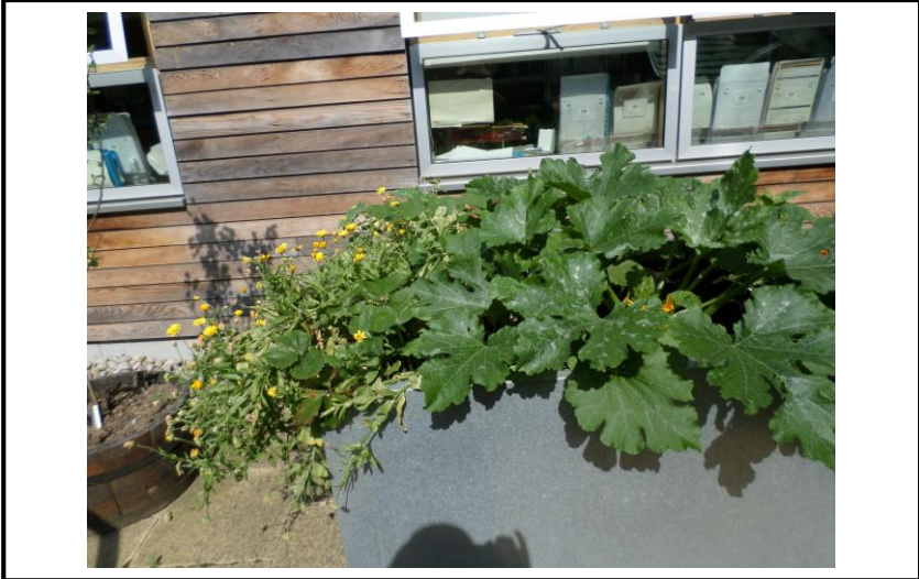
Recent blooms at Gracefield Gardens